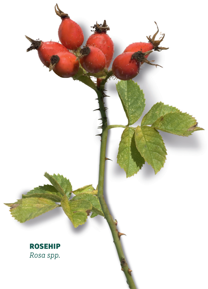
ROSEHIP Rosa spp.

REF [1]: Finzelberg study 2011; Feistel, B and Walbroel B: A purified rose hip extract – effective in a new joint health concept. Phytotherapeutika 2012, 33 (supl.1)