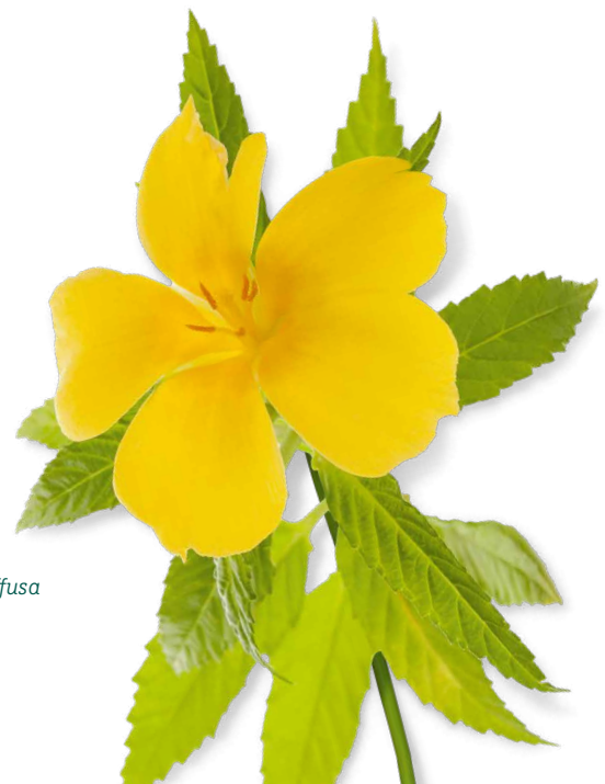
DAMIANA Turnera diffusa

Our expertise in extracting the efficacy from botanicals ensures that each batch meets the highest quality standards.